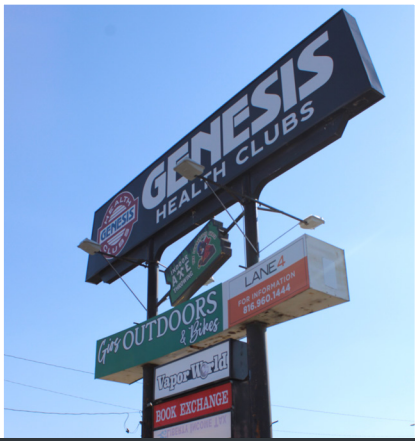
Pylon Signage Available