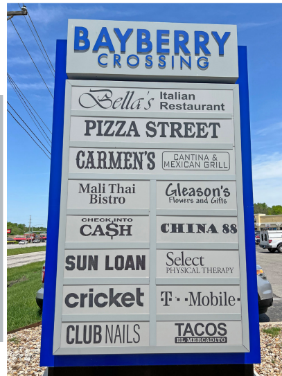
MONUMENT SIGNAGE AVAILABLE