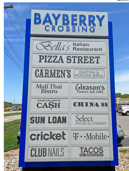
MONUMENT SIGNAGE AVAILABLE