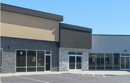
PHASE 1 COMPLETE