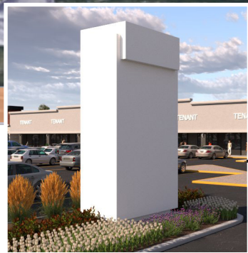
MONUMENT SIGNAGE AVAILABLE