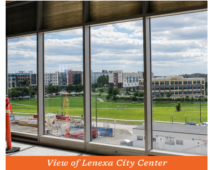
View of Lenexa City Center