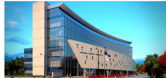
Johnson Co. Courthouse