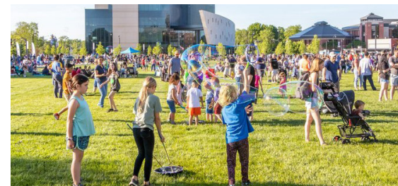
Johnson Co. Square Park