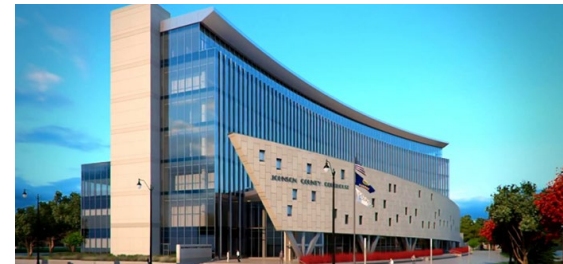
Johnson Co. Courthouse