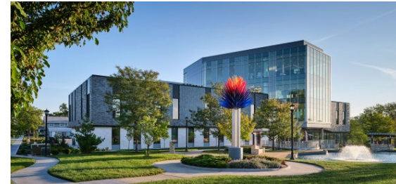
Downtown Olathe Library

WATCH how Downtown Olathe is transforming