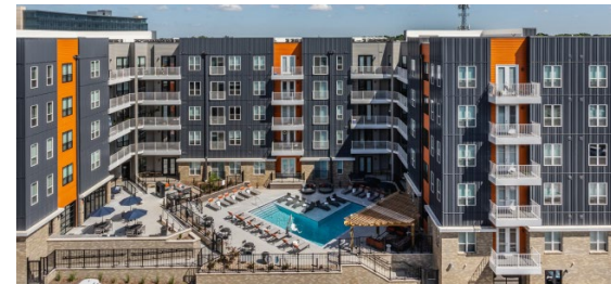
Arrello Apartments - 228 Units