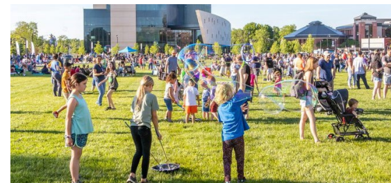
Johnson Co. Square Park