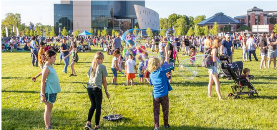
Johnson Co. Square Park