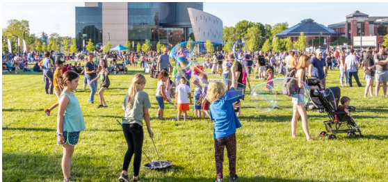
Johnson Co. Square Park