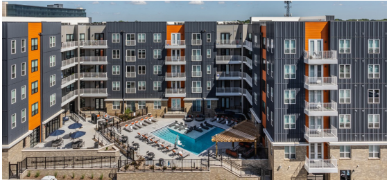
Arrello Apartments - 228 Units