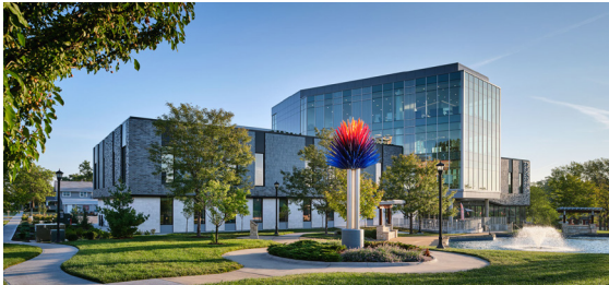
Downtown Olathe Library

WATCH how Downtown Olathe is transforming