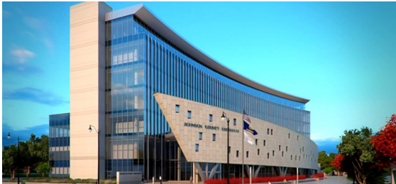
Johnson Co. Courthouse