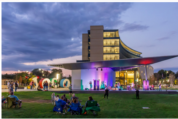
Adjacent to the new stage at the redeveloped Johnson Co. Square Park

NEW LOCAL CONCEPTS coming to Downtown Olathe: